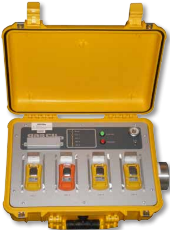
"Clip Dock" Docking Station