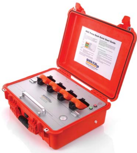
MGC Pump Dock

Size 5.7 x 3.0 x 1.5 in. (147 x 78 x 38.3 mm.) Weight 12.4 oz. (352g) Temperature -4° to +122°F (-20° to +50°C) Humidity 5% to 100% RH (non-condensing) Battery Life IR: 5 days continuous Pellistor: 30 hours continuous Charge Time 4 - 6 hours Alarms Visual, Vibrating, Audible (minimum 95 dB) Low, High, STEL, TWA and OL (Over Limit), Pump LEDs 4 red alarm bar LEDs Yellow backlight (activated on button press) Red backlight (activated on alarm condition) Yellow Maintenance Notification LED Display Alphanumeric Liquid Crystal Display (LCD) Logs 25 Bump tests 25 Events 25 Calibrations Continuous 1 second data logging (> 2 month typical capacity) Tests Full function self-test upon activation Sensors, battery and circuitry conditions