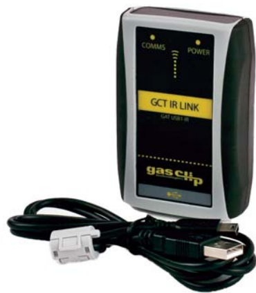
GCT IR Link

10' Sampling Hose 10 Additional Filters; 5 Hydrophobic and 5 Particulate Stainless Steel Diffusion Stone